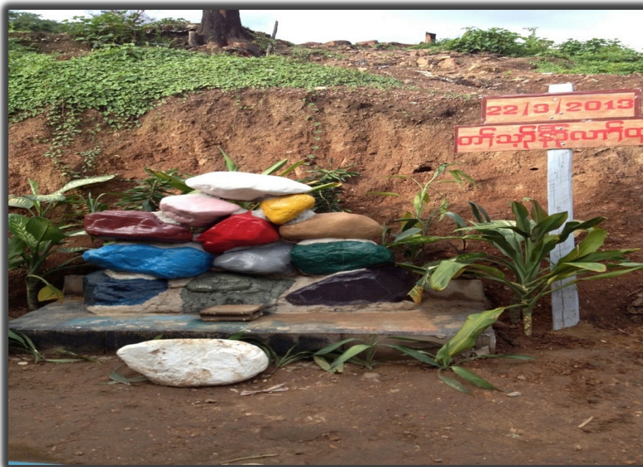
Caption: Monument in remembrance of the community members who lost their lives in the fire.

We look forward to feedback from the team and the community regarding areas that were well received as well as areas for improvement. We hope to continue our partnership and look forward to planning next years visit.